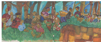
Picking Blackberries, Nuts, and Medicinal Nuts, 2000-2007